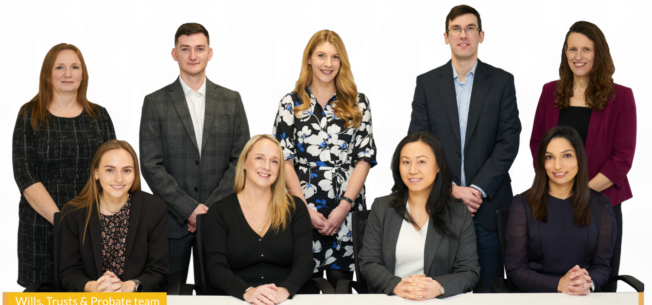
Wills, Trusts & Probate team

We're especially proud of being called a "well-oiled machine" that's "great to work with" and "focused on getting things done" - feedback that means a lot to us as we continue to serve you!