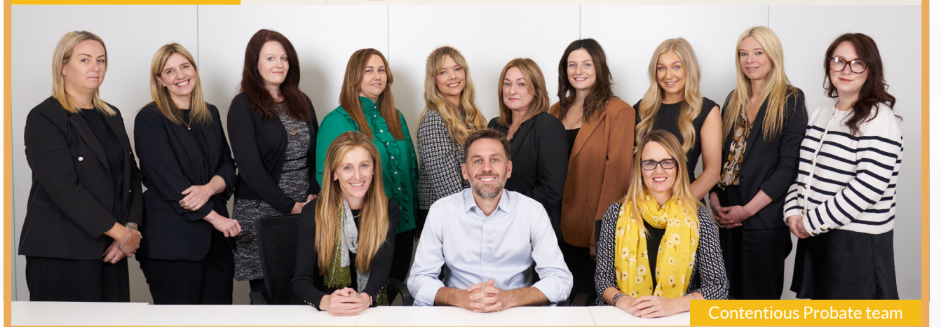
Contentious Probate team